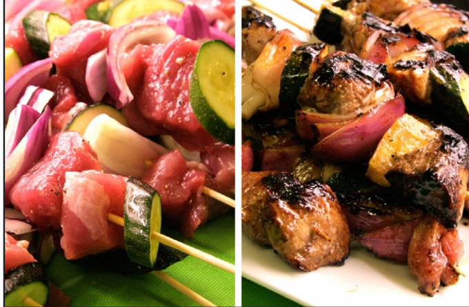
PINEAPPLE GRILLED AND BAKED CHICKEN WITH COCONUT RICE